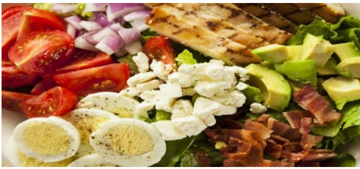
Fresh Salad Ingredients