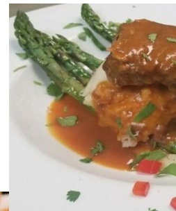
Short Rib Osso Bucco