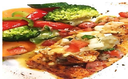
New Orleans Salmon & Shrimp

Entrees unless specified or pasta dishes are served Choice of garlic mashed potatoes, roasted red potatoes, sweet potatoes and sauteed seasonal vegetables. Sub. French onion soup or C