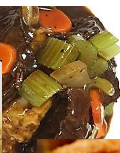
Homemade Pot Roast