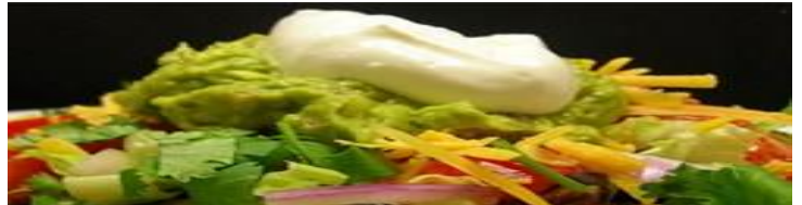
BBQ Pork, Chicken or Ground Beef Nachos