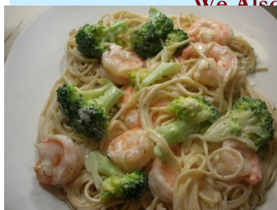
Shrimp Broccoli Alfredo

Balsamic Vinaigrette. Sides 1.50 Side, Unless Specified.