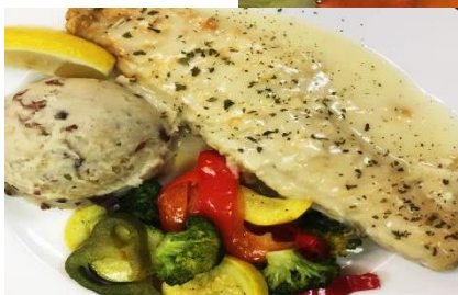
Pan Seared Walleye